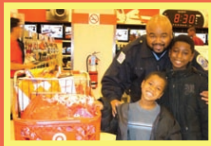
MPD Shop with a Cop Youth Program