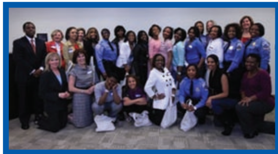
MPD's Girls Time Out program visits Merrill Lynch offices

The Washington DC Police Foundation is a tax-exempt, non-profit organization that brings together the business, civic, and other professional communities to promote public safety by providing financial and in-kind resources to the Chief of Police and the Metropolitan Police Department (MPD), by expanding public safety awareness, and by advancing public safety policy and initiatives.