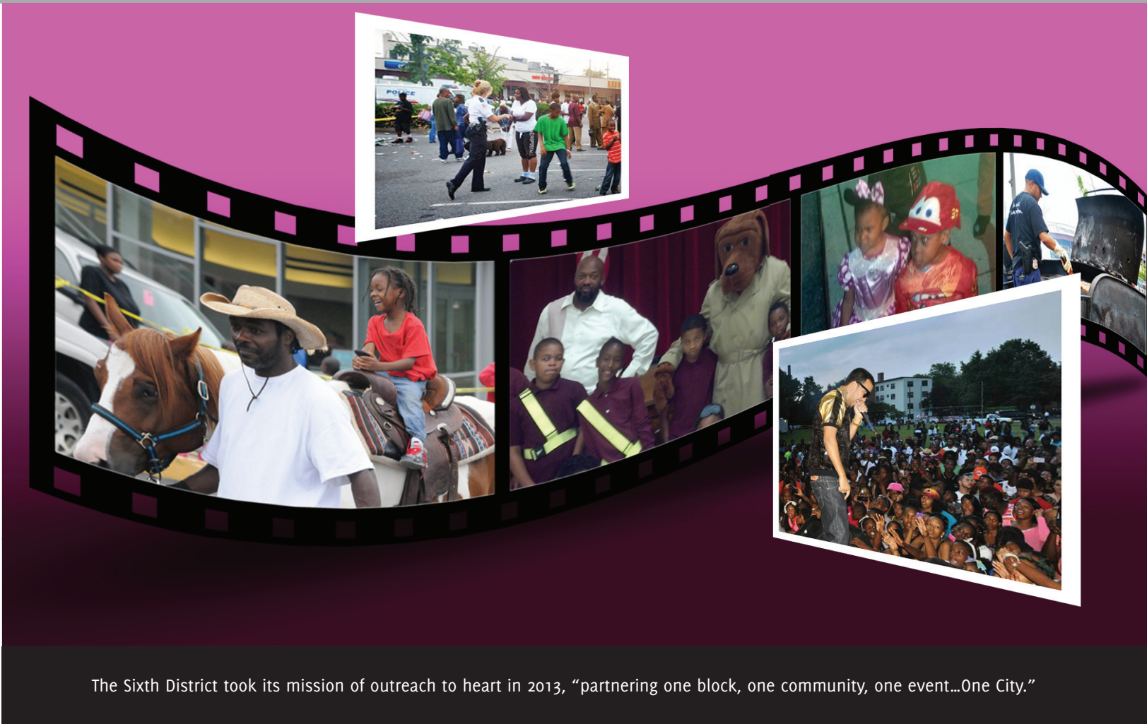
The Sixth District took its mission of outreach to heart in 2013, "partnering one block, one community, one event...One City."

The Second District is always giving schools and Cub Scout groups tours of the police station. Second District officers also participated in Hardy Middle School's 9/11 tribute event.