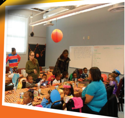
The First District Community Room plays host to dozens of events each year, including Halloween-themed events such as the popular Haunted House and Preschool Party.

During MPD's Safe Summer 2013, Outreach staff also ice cream socials to improve community relations with citizens, develop new and long lasting prevention activities for the youth, and educate the community as whole on crime prevention strategies. Socials were held in Greenleaf Gardens, Potomac Gardens, Tyler House, James Creek, Sherwood Recreational Center, and at Randall Swimming Pool.