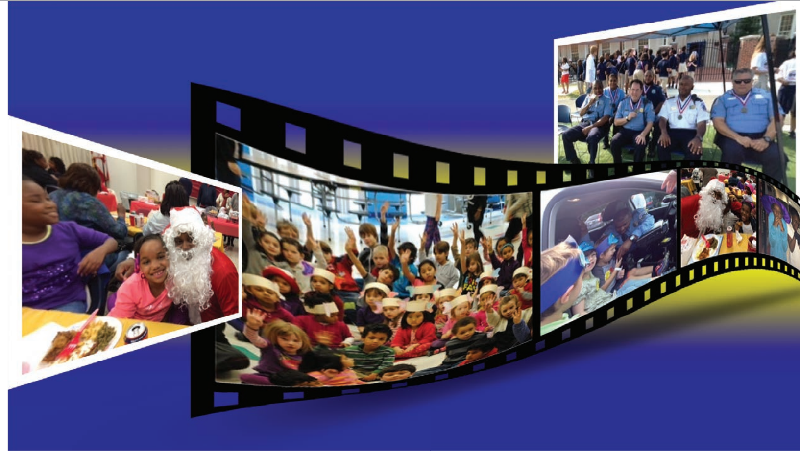
The Second District kept busy with activities centered around safety and fun for children of all ages. Some of our favorite events are our Halloween and Christmas parties, held each year at the District station.