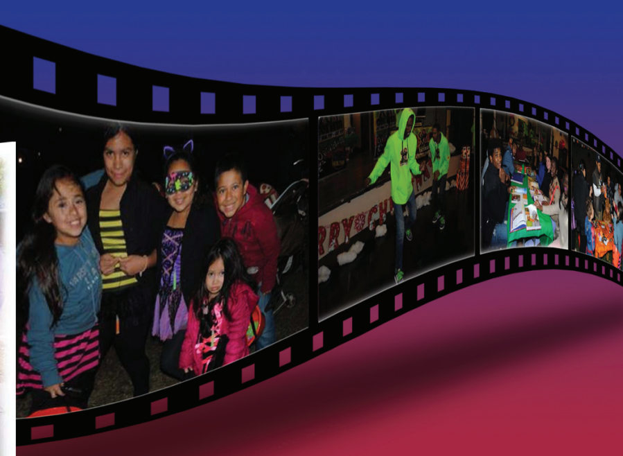
From the Annual Youth Holiday Celebration to community safety walks and Halloween Safe Haven event to fitness demonstrations, the Fourth District remains busy throughout the year.