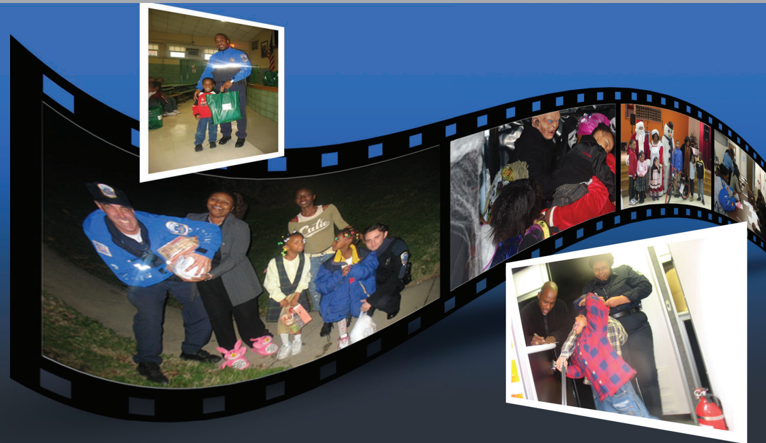
The Seventh District Outreach team has 'No Time for Crime' — its approach to treating each member of the community with respect and dignity while engendering high expectations is having a positive impact on crime.